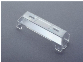
79 448 grip lug cover for NH fuse base size 00