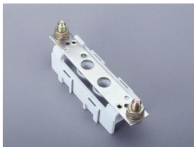
03 519 neutral conductor 160 A screw, both sides