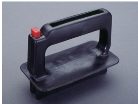
03 502 NH fuse extractor handle open size 000 - 3